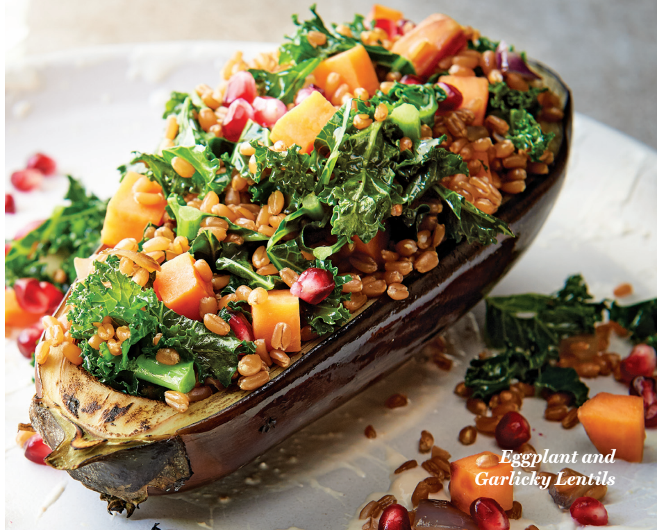
Eggplant and Garlicky Lentils

A consistent, scoopable frozen glaze that offers freedom from the most time-consuming tasks in stock-making for more time spent on perfecting signature flavors and craveable dishes.