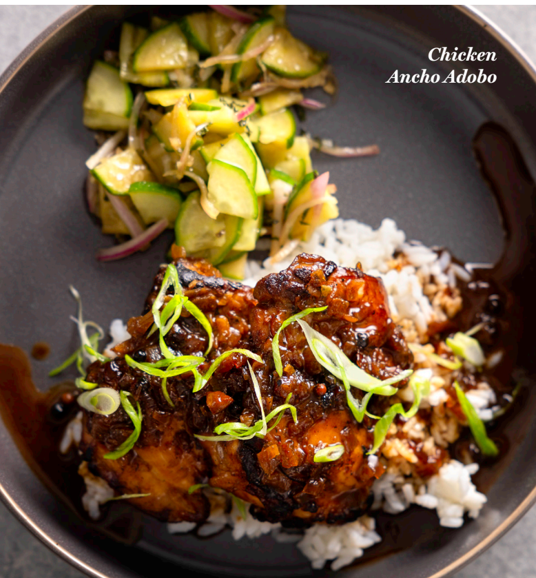
Chicken Ancho Adobo