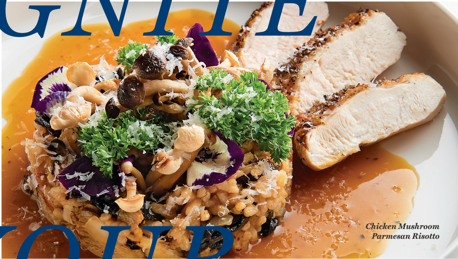
Chicken Mushroom Parmesan Risotto