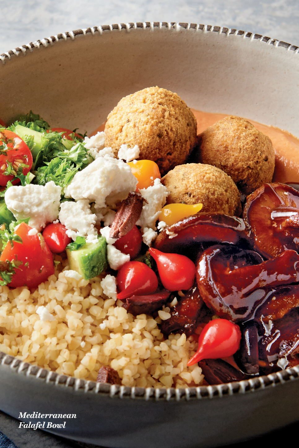
Mediterranean Falafel Bowl