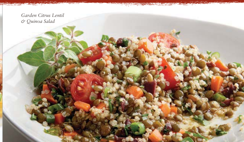
Garden Citrus Lentil & Quinoa Salad

TRY MORE FLAVOR-BUILDING SAUCES INCLUDING MINOR'S HOLLANDAISE SAUCE AND MINOR'S BEEF DEMI-GLACE.