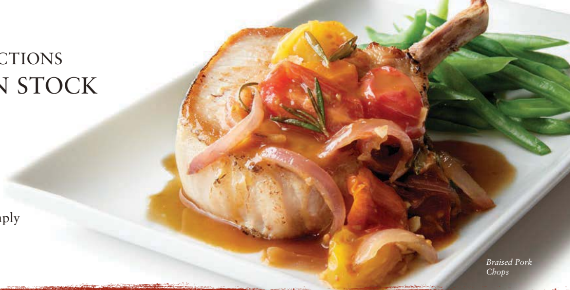
Braised Pork Chops

Create a demi or espagnole sauce or simply spoon into creations across your menu.