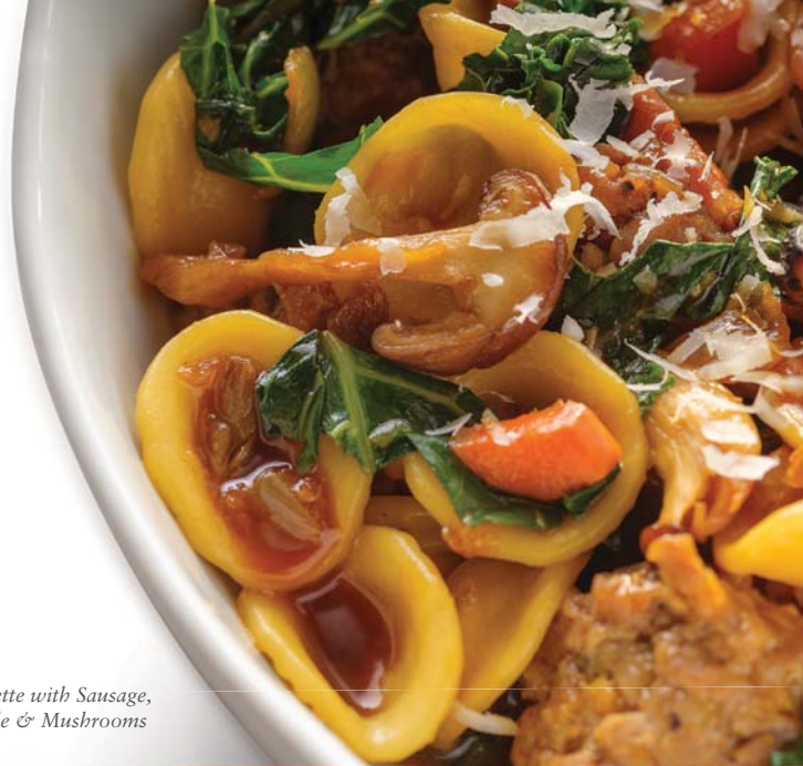
Orecchiette with Sausage, Kale & Mushrooms