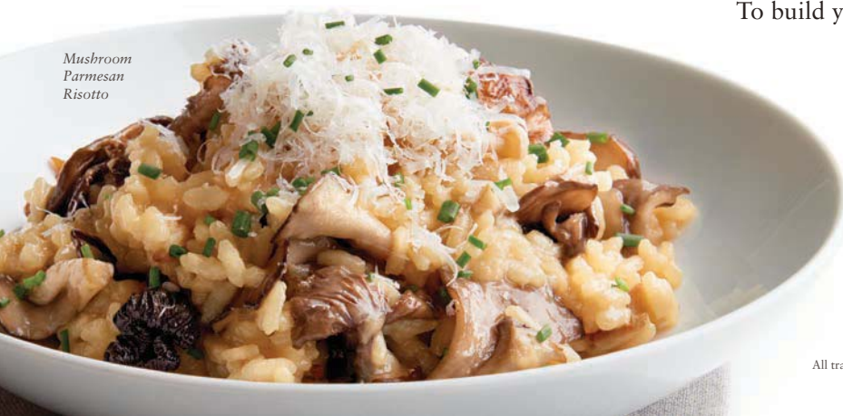
Mushroom Parmesan Risotto

To build your menu with new Minor's Reduced Chicken Stock, please contact a Minor's chef at 1.800.243.8822.